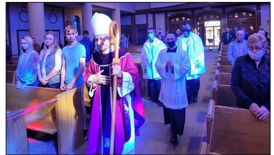
PROCESSION: Bishop Paproki enters the church during the processional for Mass.