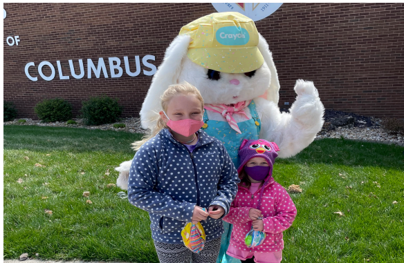
DRIVE-THRU EASTER: The Easter Bunny made an appearance at the Lady's Auxillary Easter Event on March 28.

Next meeting is April 6th at 7PM at the KC Hall.