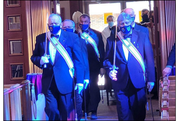
FOURTH DEGREE: Fourth Degree Knights from Council 1580 led the procession at the start of Mass.