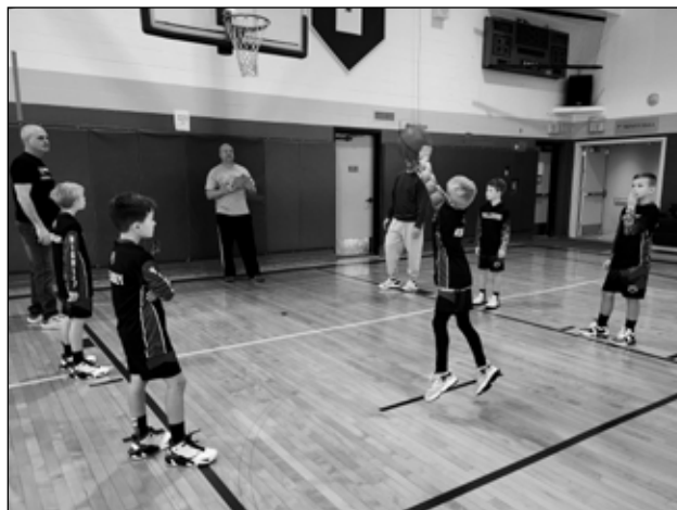
FREE-THROW CONTEST: Students from St. Paul Catholic School and the Highland Community Unit School District Unit #5 participate in the 2023 annual Free Throw Council.