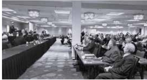
MADRIGAL SINGERS: The 125th Illinois State Convention meets to pass the annual resolutions, elections of state officers, elections of state delegates to national convention and state alternates to national convention.